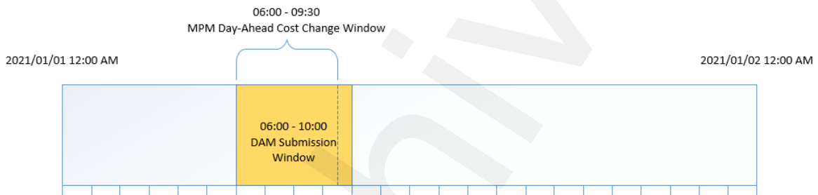
Figure 5-1: DAM Reference Level Change Request Window

A market participant may request that the IESO update a resource's reference level fuel cost components pursuant to MR Ch.7 s.22.5.5 or use an alternate cost profile for a resource pursuant to MR Ch.7 s.22.5.6 as illustrated in Figure 5-1 and Figure 5-2 below: