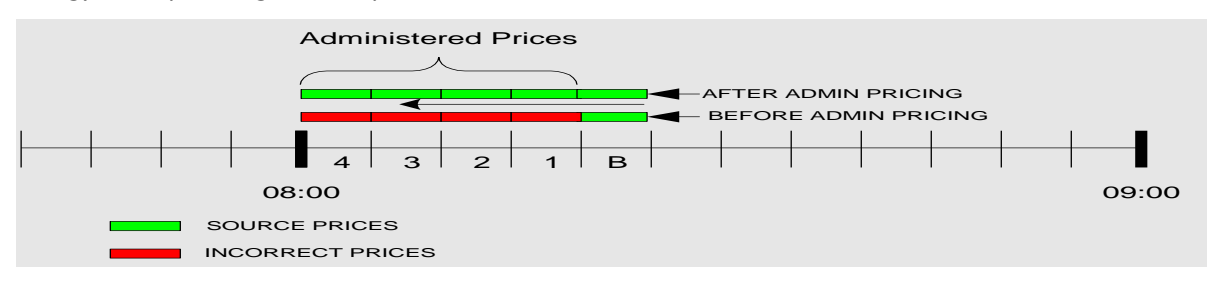
Figure A-2: Copy Backward Scenario

of MR Ch. 7, Sec. 8.4A.5.2, the IESO will replace the energy and operating reserve prices calculated incorrectly by the DSO for intervals 1-4 with the energy and operating reserve prices calculated for interval B. In doing so, the IESO will replace the 4 Ontario prices (energy, 10S, 10NS and 30) and all 39 intertie prices (energy, 10NS, 30 for all 13 intertie zones) for intervals 1-4 with the corresponding energy and operating reserve prices calculated for interval B.