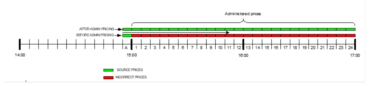
Figure A-1: Copy Forward Scenario

Assessing the market conditions at the time, the IESO determines that the energy and operating reserve prices calculated for interval A reflect, to the extent practical, the energy and operating reserve prices that would otherwise have been produced by the market for intervals 1-24. Consequently, under the provisions of MR Ch. 7, Sec. 8.4A.5.1, the IESO will replace the energy and operating reserve prices calculated incorrectly by the DSO for intervals 1-24 with the energy and operating reserve prices calculated for interval A. In doing so, the IESO will replace the 4 Ontario prices ( energy , 10S, 10NS and 30) and all 39 intertie prices ( energy , 10NS, 30 for all 13 intertie zones) for intervals 1-24 with the corresponding energy and operating reserve prices calculated for interval A.