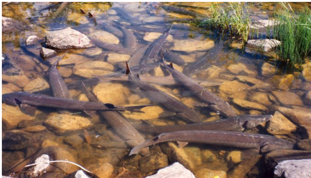
Lake Sturgeon stranded in a hydroelectric facility's overflow channel.

Significant ecological damage from waterpower has been ongoing for many decades in Ontario and other locations worldwide. 38 In fact, in Ontario, dams are considered to be a major factor in the extirpation of Ontario's Atlantic Salmon stock 39 , one of the most important causes of anthropogenic mortalities and decline of Ontario's American Eel 40 , and a key threat to Ontario's declining Lake Sturgeon populations. 41,42,43