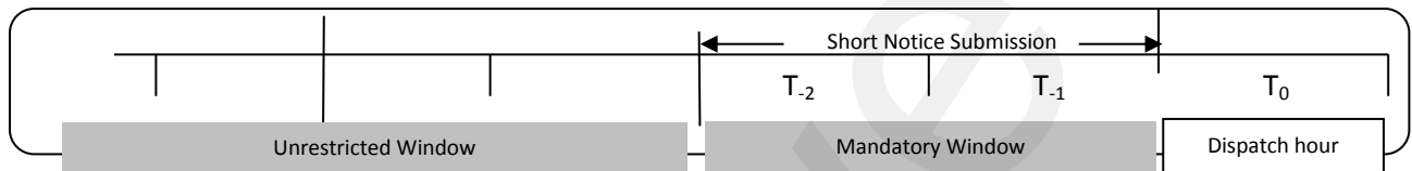
Figure B-1: Short Notice Submission Window

A short notice submission (submission - includes bids or offers ) is defined as any real-time dispatch data submission which occurs within two hours, of the start of a dispatch hour identified in the submission.