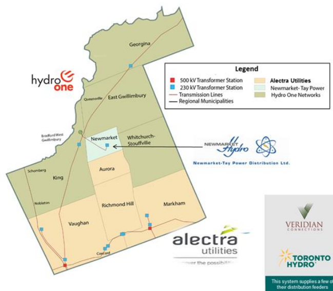
Figure B-2: Geographical Boundaries of GTA North (York Region)

The GTA North Region (York Region), as shown in Figure B-1, roughly comprises of municipalities in York Region (Vaughan, Richmond Hill, Markham, Aurora, Newmarket, King, East Gwillimbury, Whitchurch-Stouffville and Georgina) and Chippewas of Georgina Island. Its electrical infrastructure also serves parts of the City of Toronto, Brampton, and Mississauga.