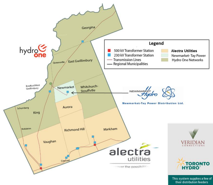
Figure 1: Geographical Boundaries of GTA North (York Region)

GTA North Region (York Region) is one of the fastest growing regions in Ontario. Provincial policies, including the Places to Grow Act and the Greenbelt Act, have played a key role in facilitating and driving development in this region. While a large portion of the land in this region is part of the designated Greenbelt area and is protected from urban development, the 2005 Places to Grow Act has promoted rapid intensification and development in specific designated urban areas surrounding and south of the Greenbelt. Extensive urbanization in these areas over the past decade has resulted in continued increase in electricity demand. In 2017, GTA North (York Region) had an electricity demand peak of over 2000 MW. Under the updated province's Places to Grow Act 2017, significant population growth and intensification are expected to continue in GTA North (York Region) in the coming decades.